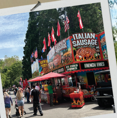
In addition to the boat races, there was a carnival.