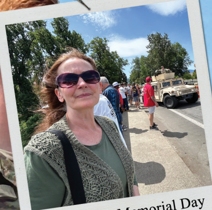
Dawn at the Memorial Day Service in Southern Oregon.