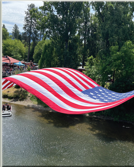
There was a large Memorial Day Service in Southern Oregon.