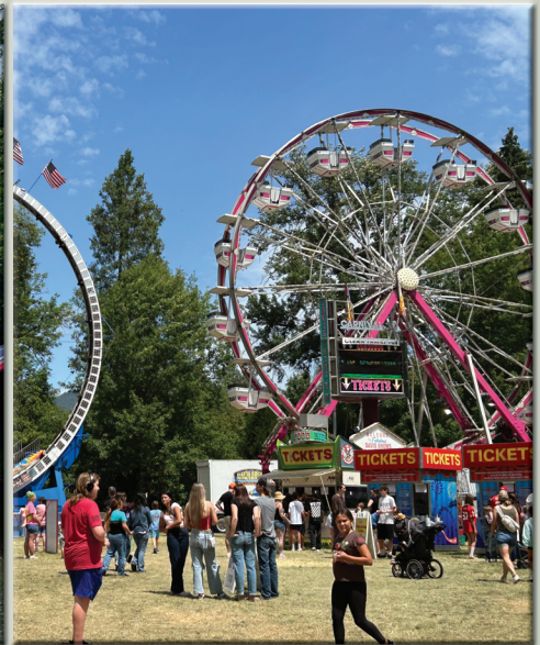
After the Service, we walked through the carnival area.