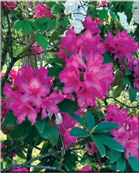
The flowers are in full bloom.