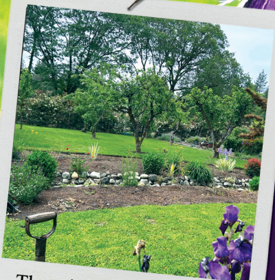
The ministry house where we have stayed.