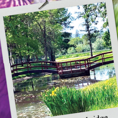
A nice walking bridge at a local park.