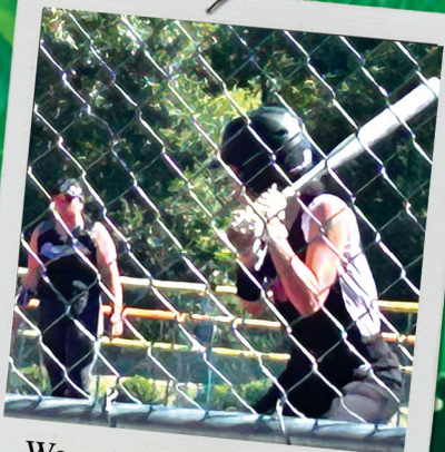
We got to watch our niece play softball.