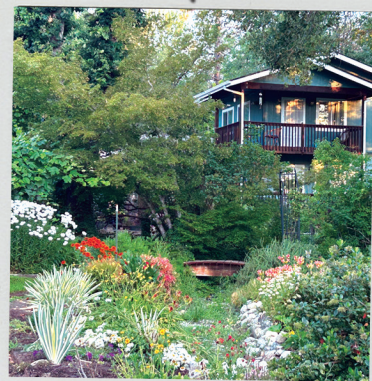
We are going to miss living at the ministry house.