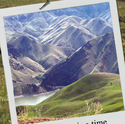
Springtime is a time to explore new areas.