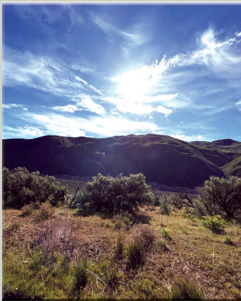
Springtime brings blue skies and warm days.