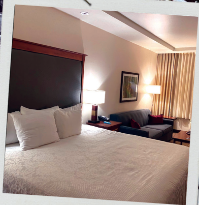
It was so nice to have a clean and furnished room when I preached.