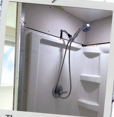
The remodel in our house is making progress.