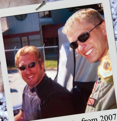
I found this photo from 2007 of me sitting in an F-15 jet.