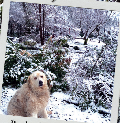
Rocky does not seem to be cold in the snow.