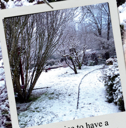
It was nice to have a fresh blanket of white powder.