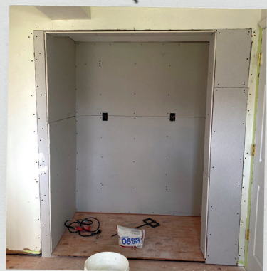
Our bump out wall got covered with sheet rock.