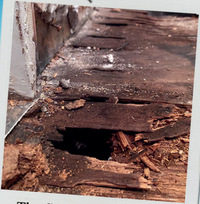
The floor had completely rotted out.