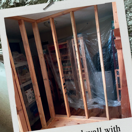
The recessed wall with completed framing.