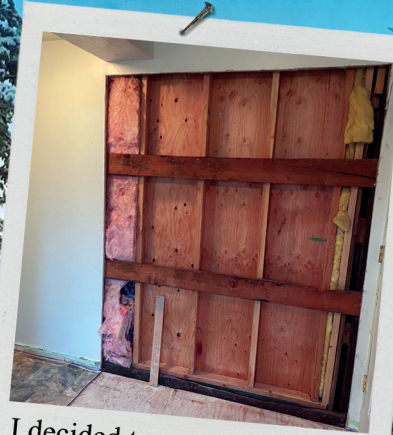
I decided to cut out a wall for a recessed wall for the fridge.