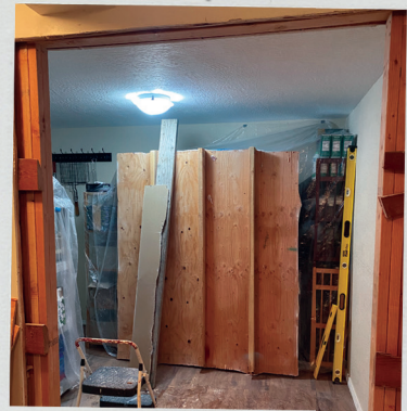
The wall cut out and framed to code.