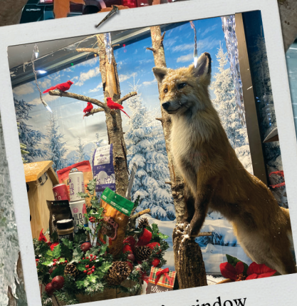
A store's window Christmas scene.