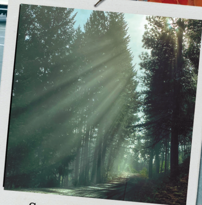
Sun rays penetrating the forest trees.