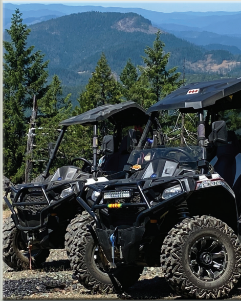
My friend gave me a mountain tour with his off road toys.