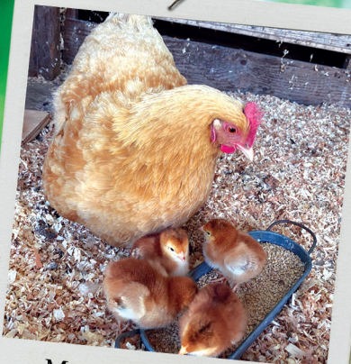
Mommy hen with her adopted baby chicks.