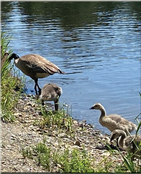
Young geese at the one of the local lakes.