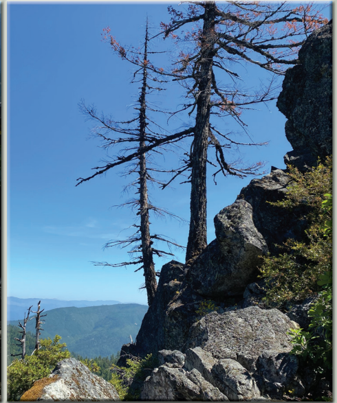
The mountains are a great place to encounter the Lord.