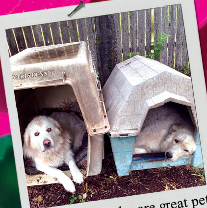
Shasta and Rocky are great pets at the ministry home we live at.