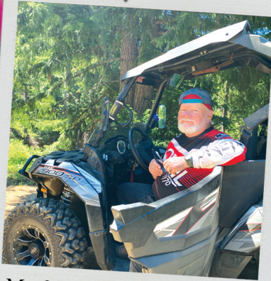
My friend has an off road toy and took me on a mountain ride.