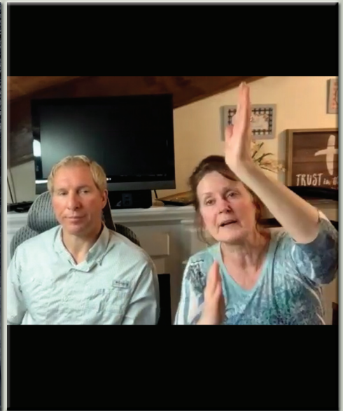
Dawn ministering during a prayer session on Zoom.