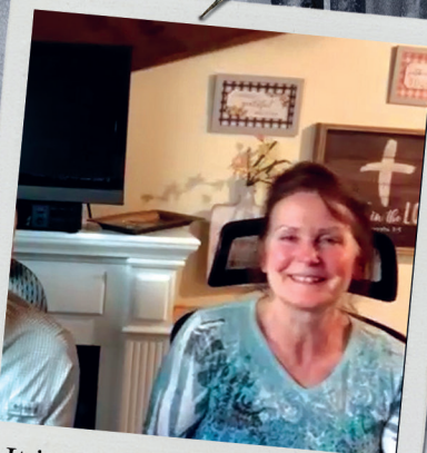
It is always wonderful to be able to minister to people.