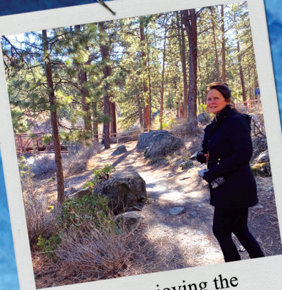
Dawn enjoying the River Trail in Central Oregon.