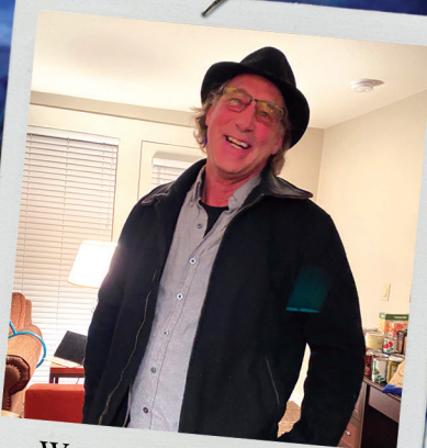
We got to see a favorite friend in Central Oregon.