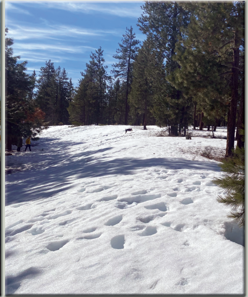
We got to experience snow while in Central Oregon.