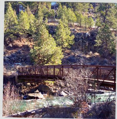
A footbridge over the Deschutes River in Oregon.