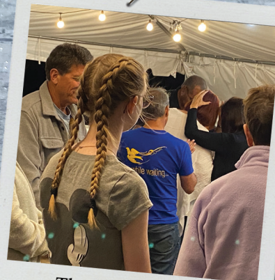
The tent revival in Washington State.