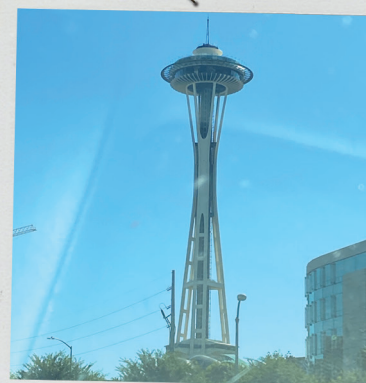
The Space Needle in Seattle, Washington.