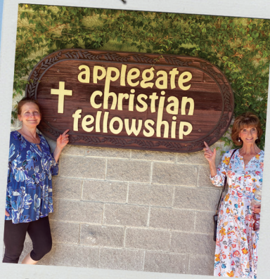
Our friend visited us from Cabo San Lucas, Mexico.