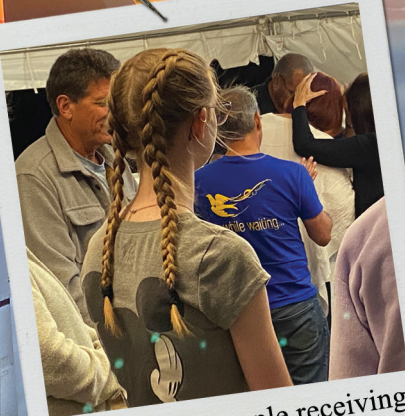
Some of the people receiving ministry at the tent revival.