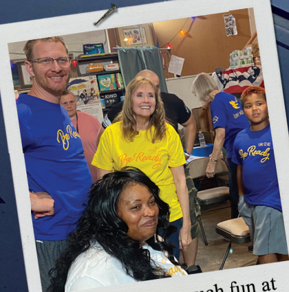
We all had so much fun at every ministry session.