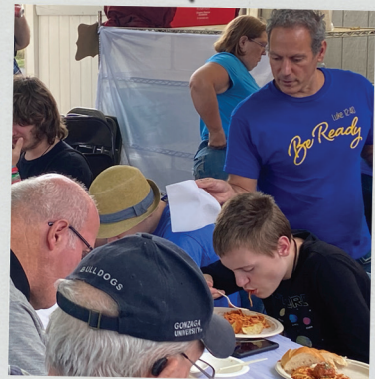
A food outreach to people in Spokane.