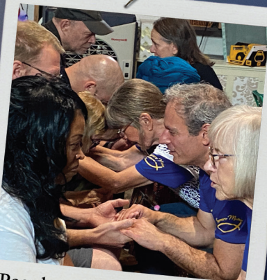
People praying and speaking encouragement over each other.