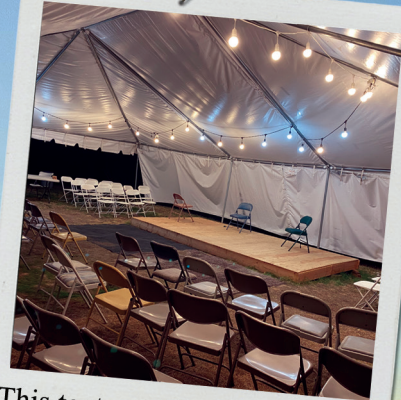
This tent got filled with people, the presence of God, & miracles.