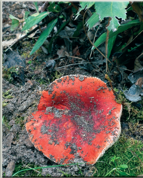
A wild mushroom in the forest.