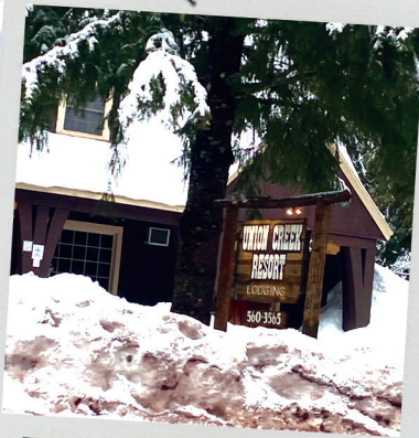
Even in April, there was an abundance of snow.