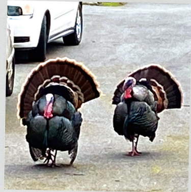
Thanksgiving in April? Free range wild turkeys.