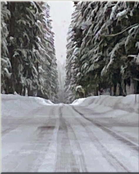
A snow storm in April.