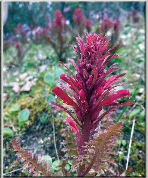
The vegetation is finally beginning to surface.