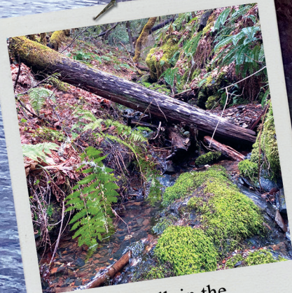
A walk in the forest.