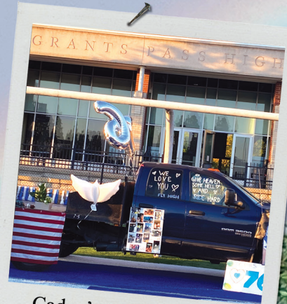
Caden's truck and some personal items.