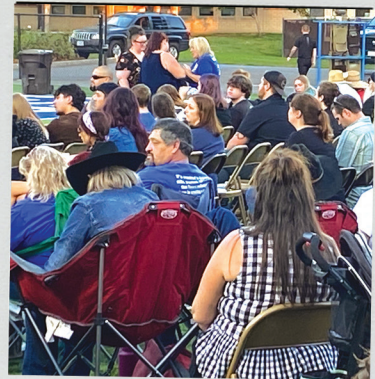
Several hundred people came to the Memorial Service.