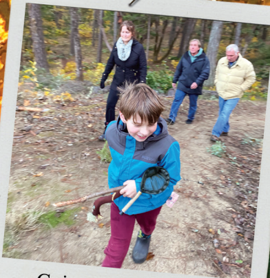
Going on a hike with the family.