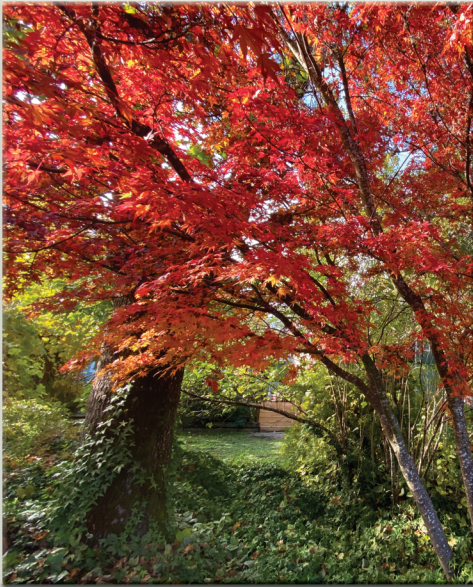
The leaves illuminated their brilliant colors.