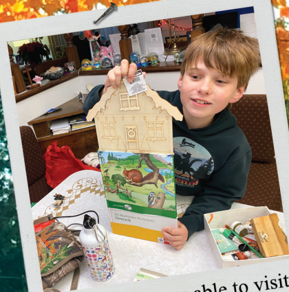
Our nephew was able to visit during Thanksgiving.