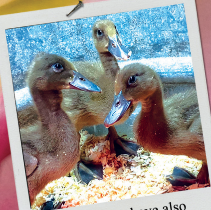
Baby ducks have also come to the ministry house.