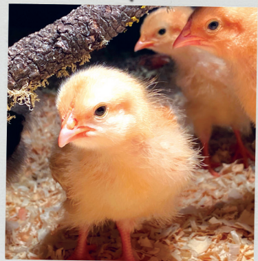
New baby chicks at the ministry house.