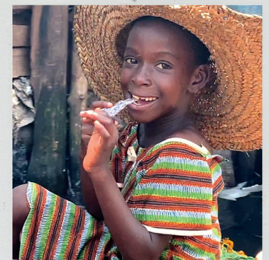
An adorable girl living life in the slums.