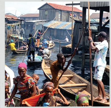
Typical travel in the water slums.