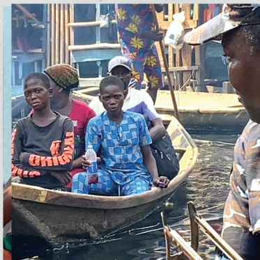
My life is regularly threatened while I am in Nigeria.