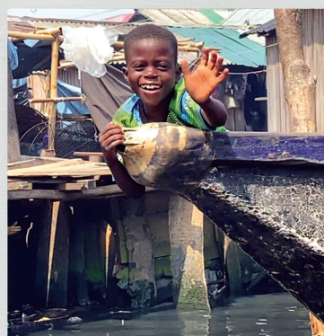
A happy young boy living in the slums.