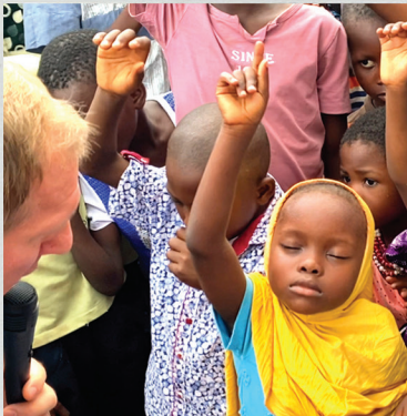
A five year old Muslim girl encountered Jesus.