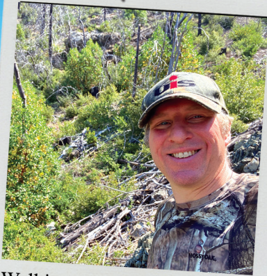
Walking in the forest is a great place to encounter the Lord.