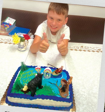
We got to celebrate my nephew's 10th birthday.