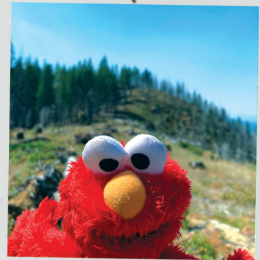
Somehow Elmo ended up on my hiking trip.