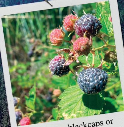
These are blackcaps or wild black raspberries.