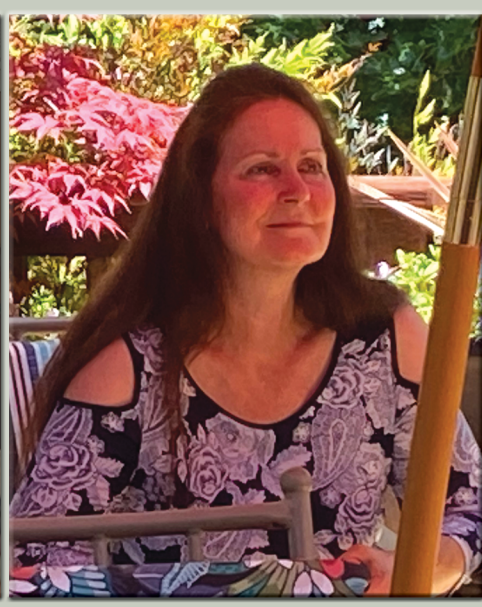
Dawn at the Destiny Activated session.