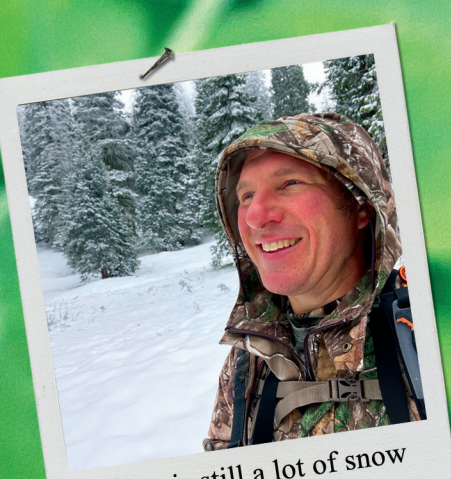
There is still a lot of snow in the higher elevations.