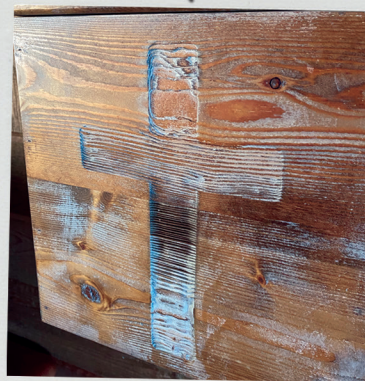
Everything in life points to the cross.