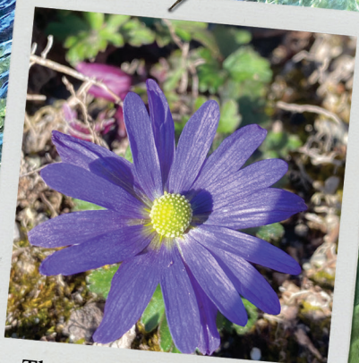
The beautiful royal purple that ordains this flower.