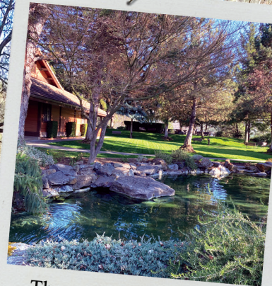
The peaceful water pool at the Retreat Center.