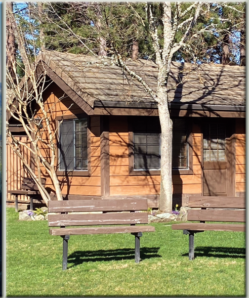
This was our little cabin we stayed in while on the retreat.