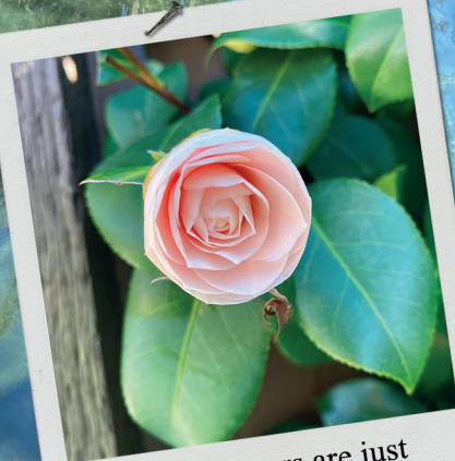
Some flowers are just beginning to open.