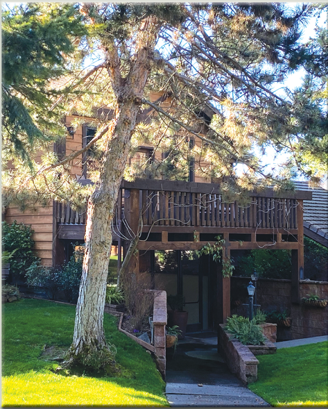
The main lodge at the church Retreat Center.