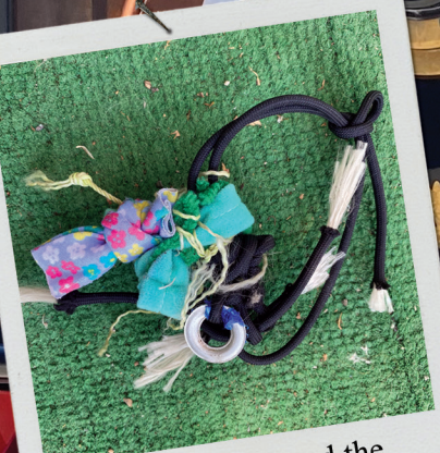
The man removed the witchcraft amulet.