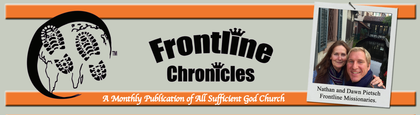
Dear Friends & Family