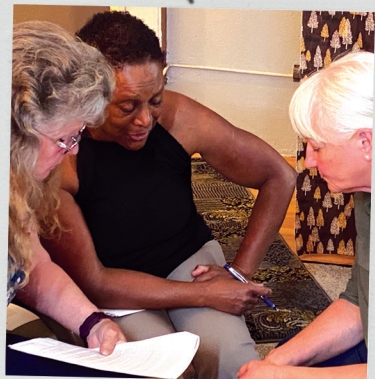
Working through an Inner Healing case study.