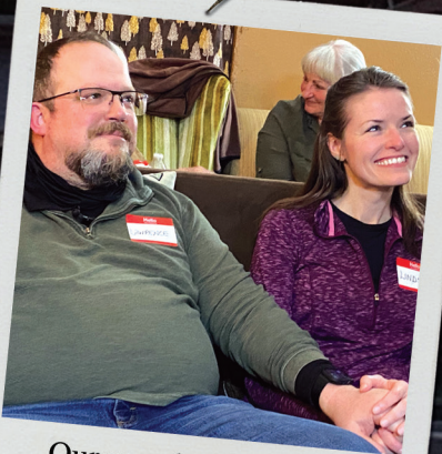
Our wonderful friends joined the workshop.