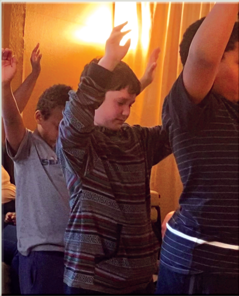
The children were able to encounter the Lord.