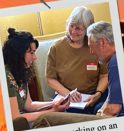
The group working on an Inner Healing project.