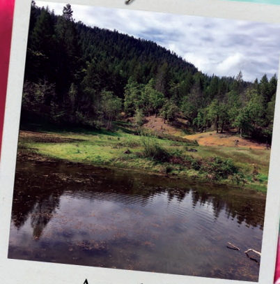
A wonderful mountain lake.