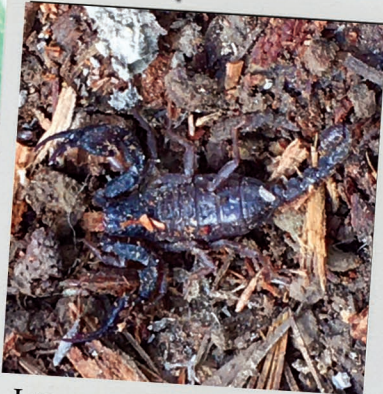
I saw a scorpion in the forest and thought of Luke 10:19.