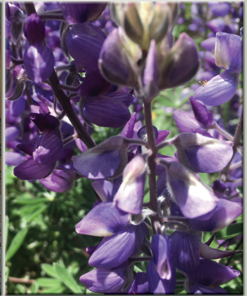
There is no shortage of colorful flowers.