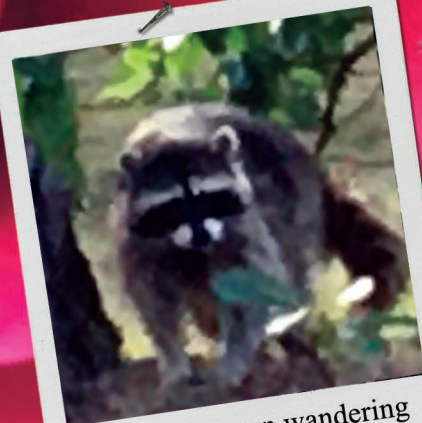
I saw a raccoon wandering around the neighborhood.