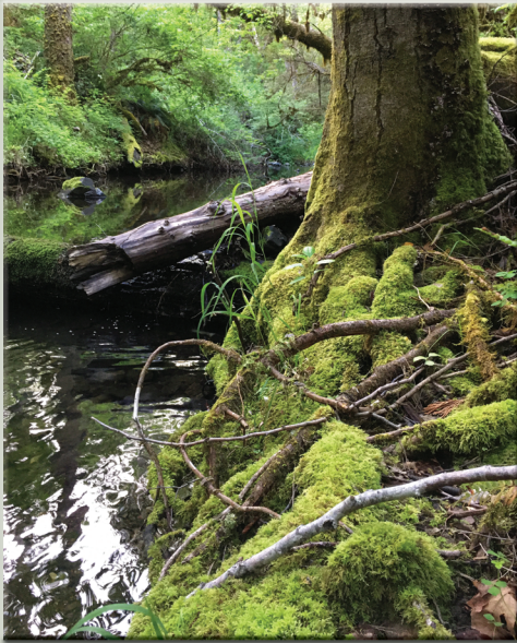
A mossy green forest next to a flowing watery creek.