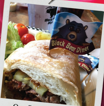
Our first restaurant in two months.