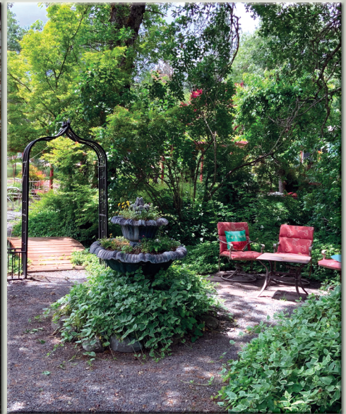
A part of the property of the ministry house where we stay.