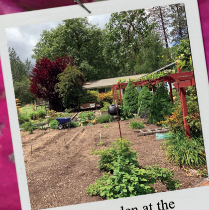
The garden at the ministry house.