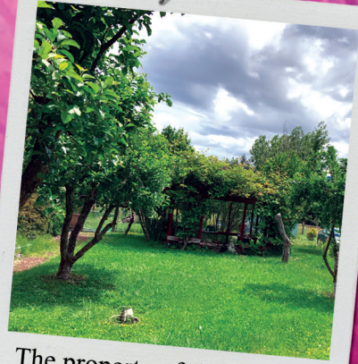
The property of the ministry house where we live.