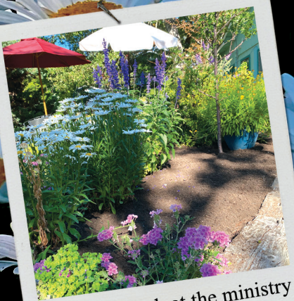
A flower patch at the ministry house where we are staying.