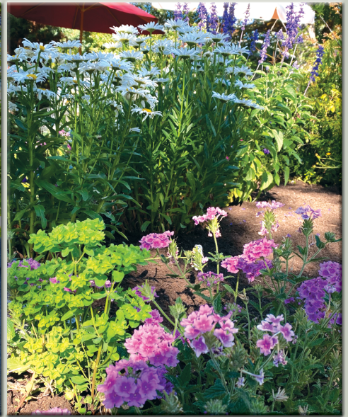
A flower patch at the ministry house.