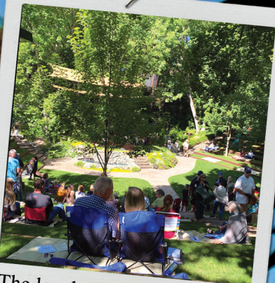
The local churches have now begun to reopen.