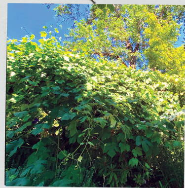
The grape vines are in full force.