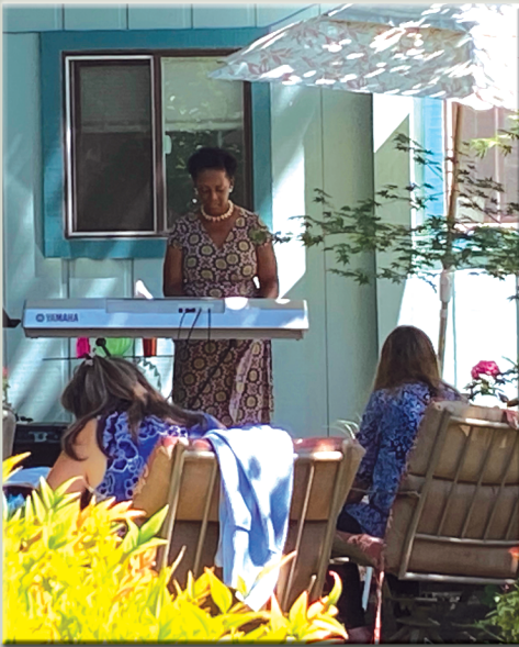
It is wonderful to have church opening up again.