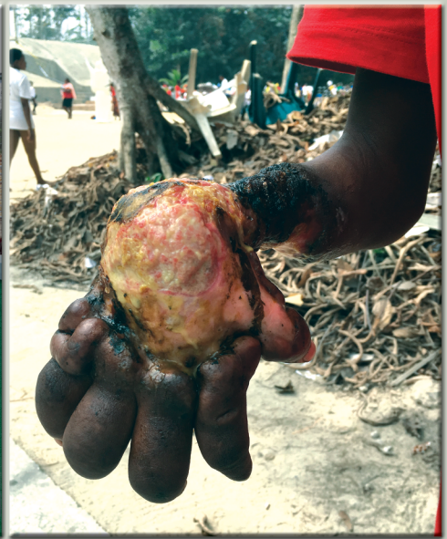
This 16 year old girl had the flesh on her hand rotting away.