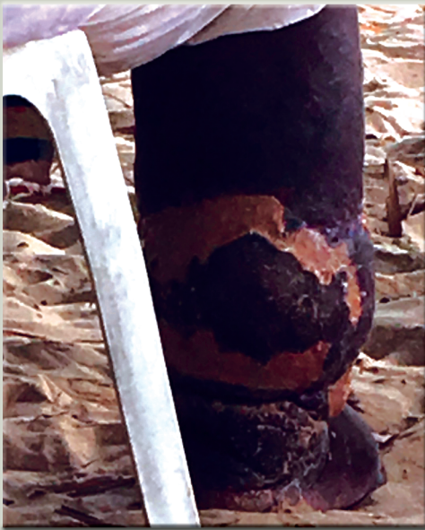
This man's leg was swollen twice normal size.