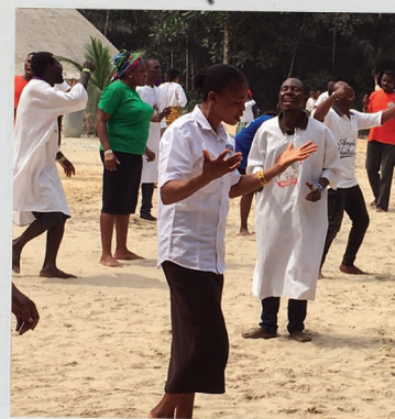
African brothers and sisters in deep prayer.