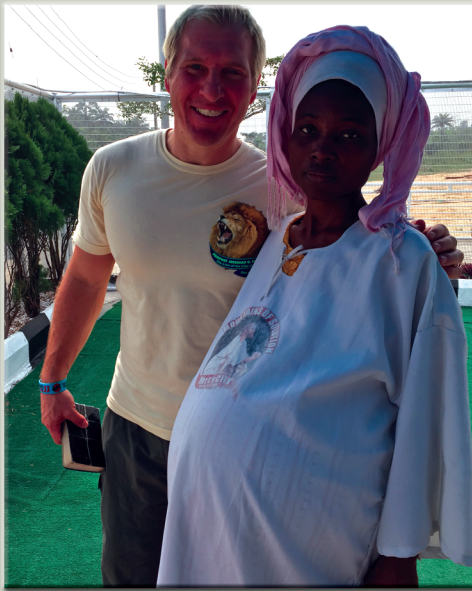
This woman was pregnant for four years unable to give birth.