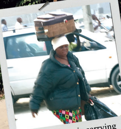
This woman is carrying her suitcase on her head.