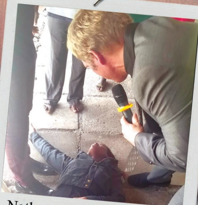
Nathan casting demons out of a woman at the church.