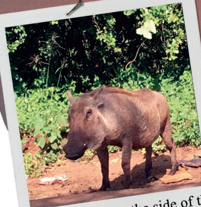
A warthog along the side of the road in Nairobi, Kenya.