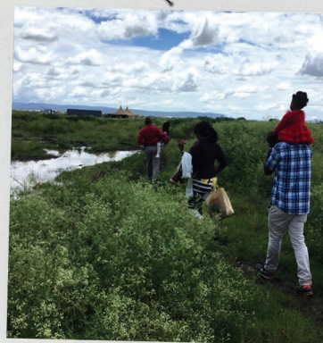
Walking through the swamps to preach at a church.