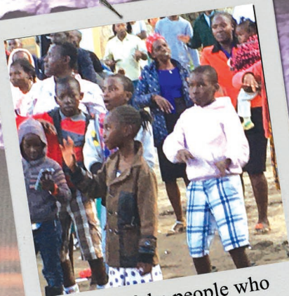
Some of the people who attended the crusade in Kenya.