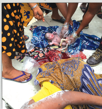
This woman give birth to a baby on the dirty sidewalk.