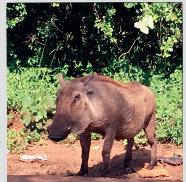
I saw numerous warthogs in Kenya.