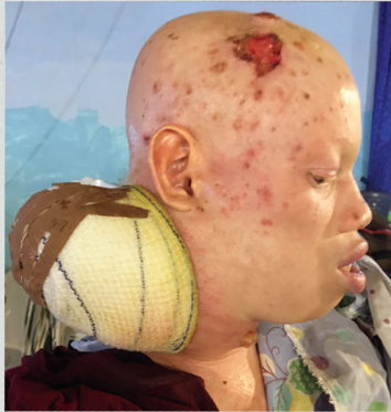
This albino man had a tumor protruding from his neck.