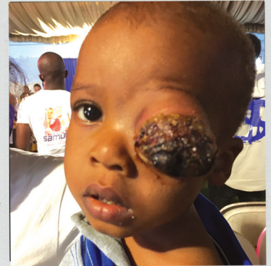
This boy's eye was popping out of his head.