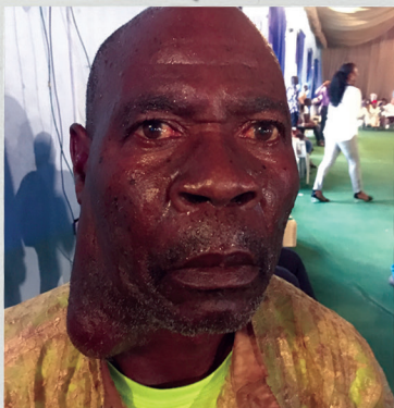
This man had a giant goiter in his throat.