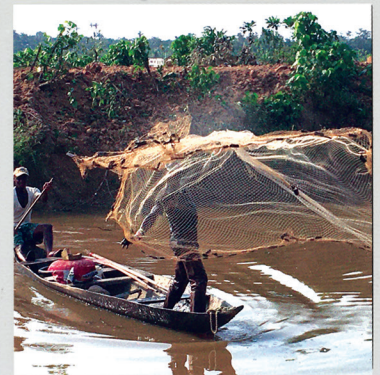
Nigerian fisherman trying to catch catfish and tilapia.