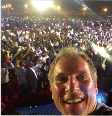
In Nigeria, there were thousands of people to minister to.