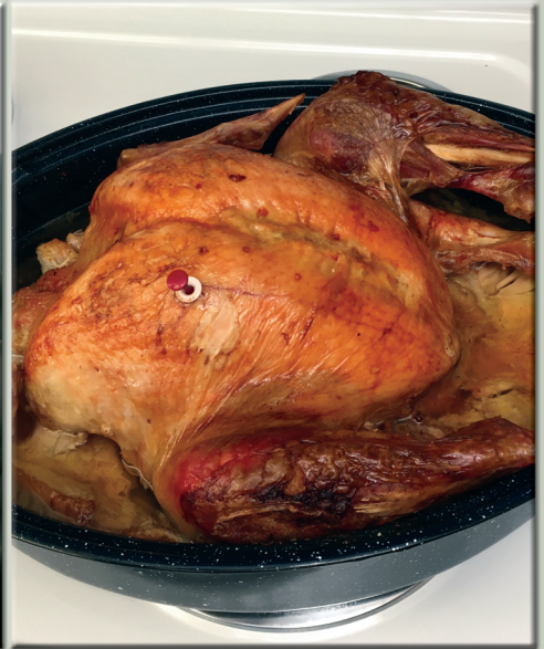
November is always a time to be thankful.