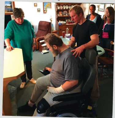
The group praying for "Jerry" to be healed in Jesus' name.