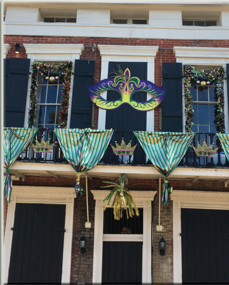
A Mardi Gras house decorated in New Orleans.