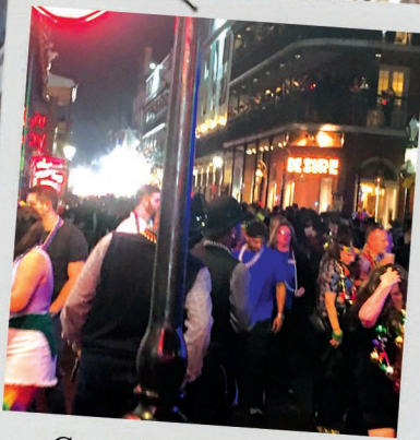
Crowds of people were partying on Bourbon Street.