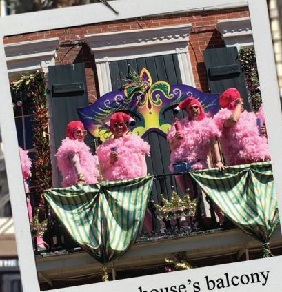
Men on a house's balcony in the French Quarter.