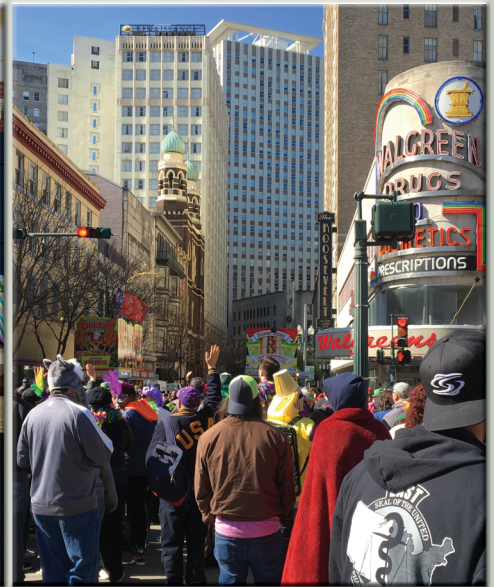
Multitudes of people attended the parades held on the streets.