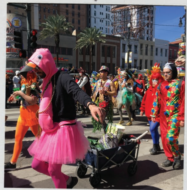
Costumed people marching down Canal Street.