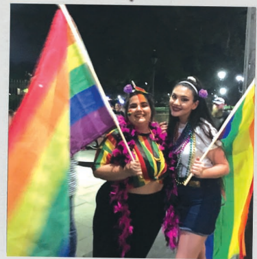
Two women parading their alternative lifestyle.