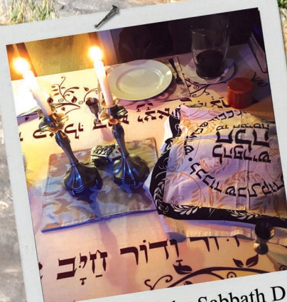
We celebrated the Sabbath Day with family in Texas.