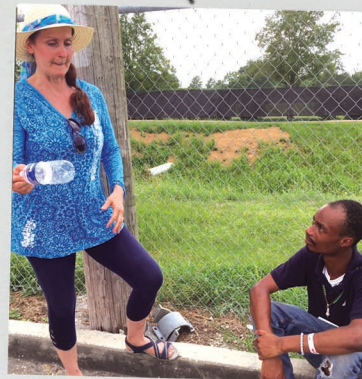
Dawn ministering to a man at Feed the Multitudes.