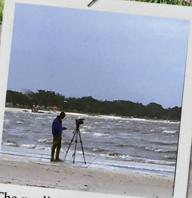
The media and all of the south prepared for Hurricane Barry.