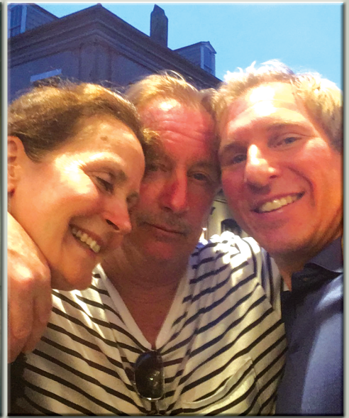
We ministered a lot to an intoxicated Australian man.