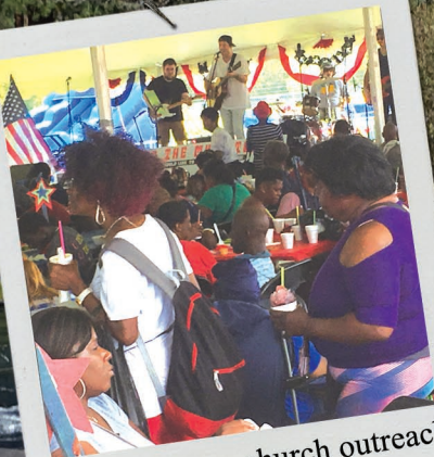
We helped at a church outreach called, Feed the Multitudes.