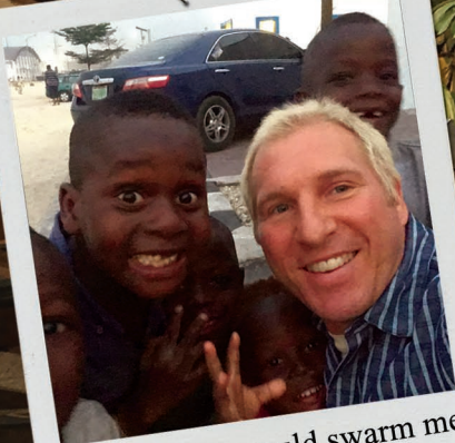
The children would swarm me and I would pray for them.