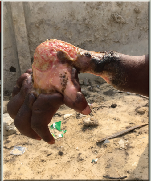
I prayed for her for a week. New skin and flesh is growing now.