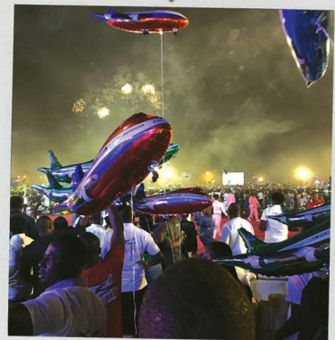
The 2019 New Year celebration.