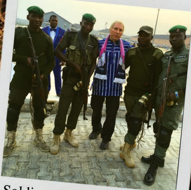
Soldiers at Mercy Christland Deliverance Ministry.