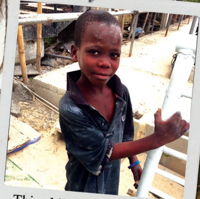
This child is a ten year old full-time construction worker.