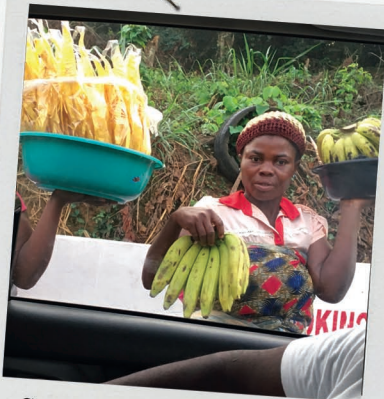
Street vendors trying to sell us bananas while driving.