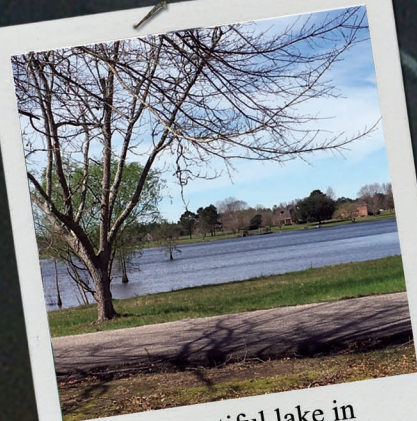
A beautiful lake in Mississippi.