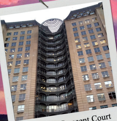
The Hotel Crescent Court in Dallas, Texas.