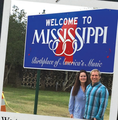
We traveled to Mississippi to preach and minister in a church.