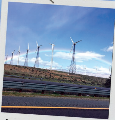
Just as we were leaving CA, a complete rainbow appeared.