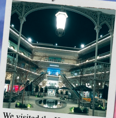
We visited the Hotel Crescent Court in Dallas, Texas.