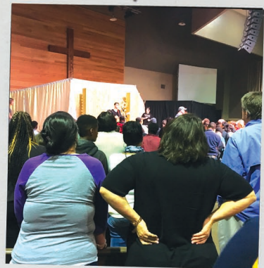
Dawn and I helped pray for people at an evangelism outreach