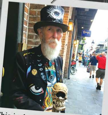
This is the type of adversity we face in the French Quarter.