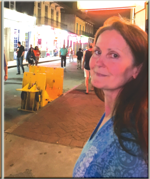
Dawn on the streets in the French Quarter helping with ministry.