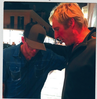
Praying for an emotionally broken man in the Quarter.