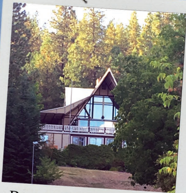
Dawn and I are helping at a retreat center near Spokane, WA.