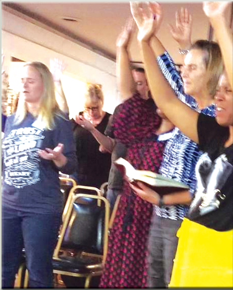
The people were very impacted by the conference.