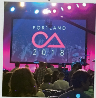
Dawn and I went to Compassion to Action in Portland, OR.