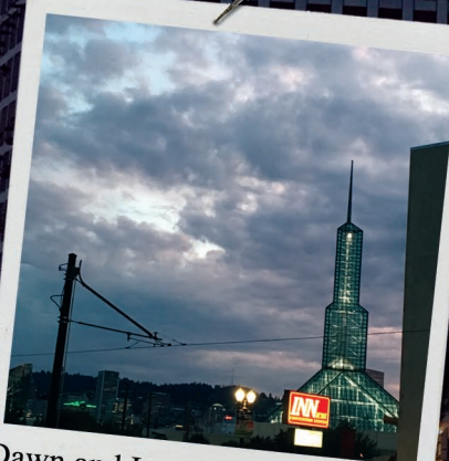
Dawn and I were able to pray for people on the streets in Portland.