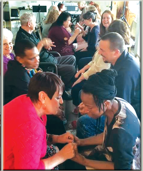
The group was empowered to live expecting God to use them.