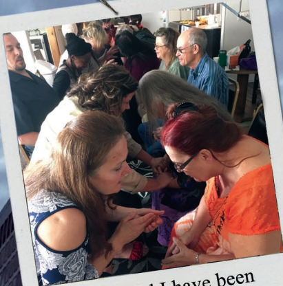
Dawn and I have been ministering weekly.