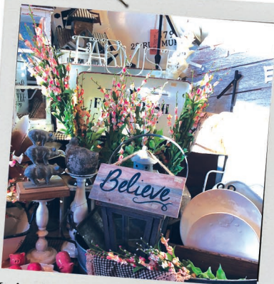
It is time to "Believe" all things are possible with God.