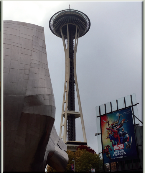
Dawn and I went to Seattle to pray over the city.