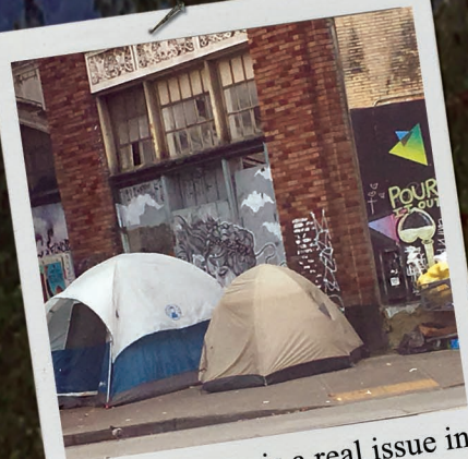
Homelessness is a real issue in Seattle, Washington.