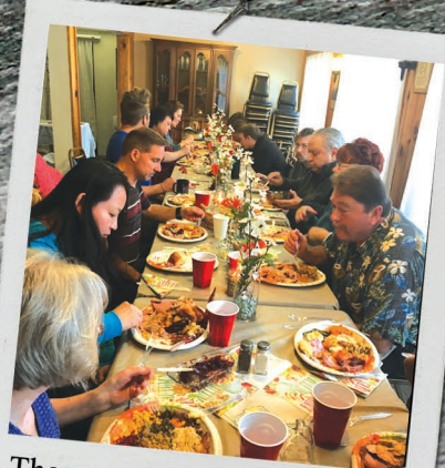
There were many people who attended Thanksgiving dinner.