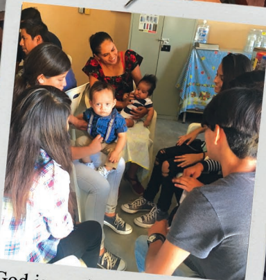
God is producing great fruit in these wonderful people.