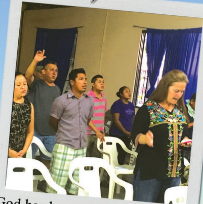
God has begun an amazing work in the Mexican community.