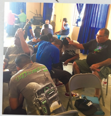
People are beginning to catch the fire of the Holy Spirit.