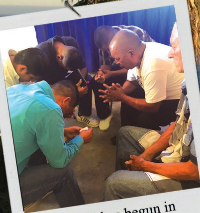
Revival has begun in Cabo San Lucas.