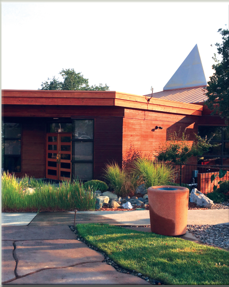
We visited the Alabaster Prayer House in Redding, California.