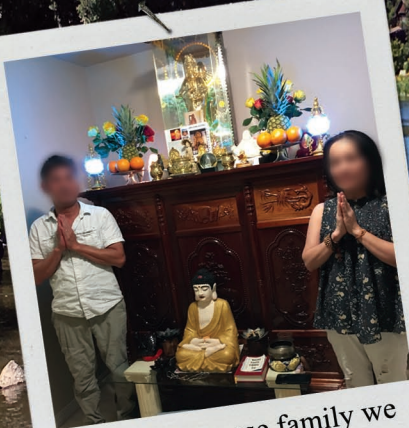
The Vietnamese family we prayed for in their Buddha room.