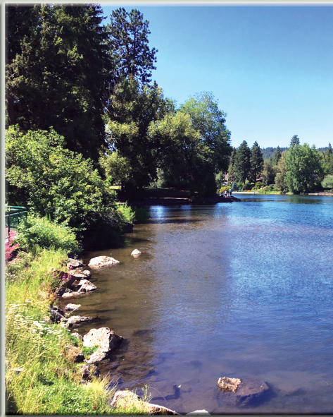
We were able to go to Central Oregon to do ministry.