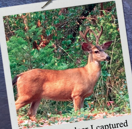
A photo of a deer I captured in Southern Oregon.