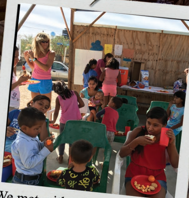
We met with other missionaries and helped feed hungry children.