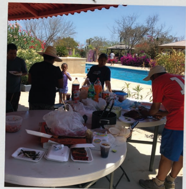
We have connected well with the locals. This is a BBQ party.