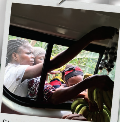
Street vendors trying to sell us goods while stopped in the van.