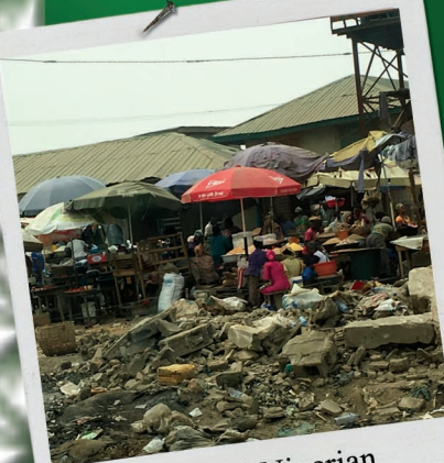
A typical Nigerian marketplace.