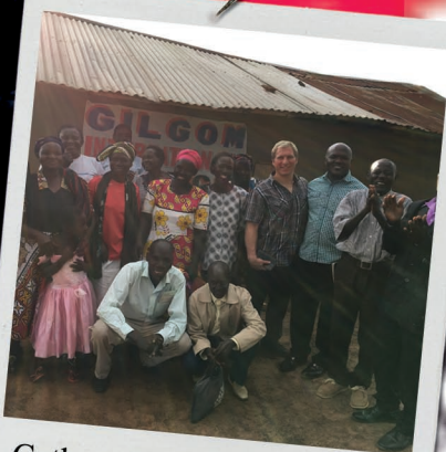
Gathered with other believers in the Lord after I preached.