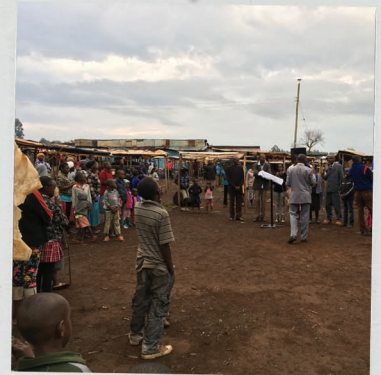
Preaching at the open air market in Kenya.