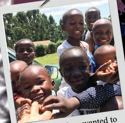
All the children wanted to shake my hand after I preached.