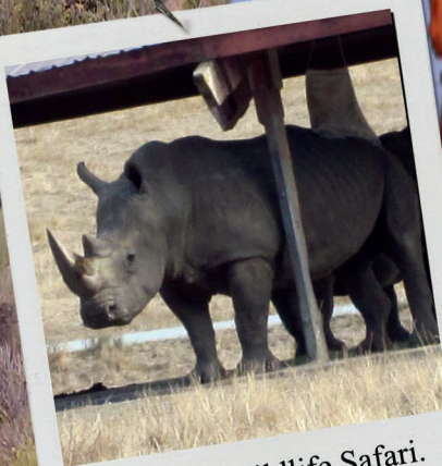
Rhinos at Wildlife Safari.