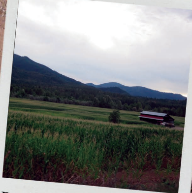
Beautiful Oregon countryside.