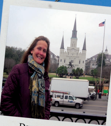
Dawn overlooking Jackson Square.