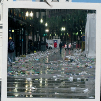
Trash galore after Mardi Gras.