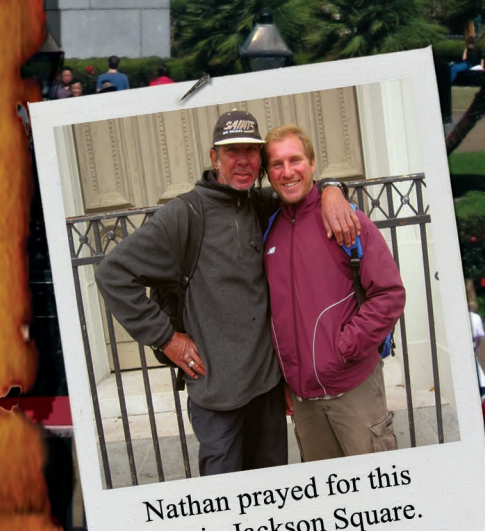
man in Jackson Square.