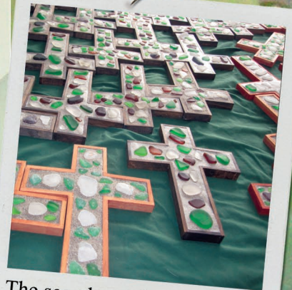
The sea glass inlaid in crosses is used to preach the Gospel.

In some aspects, sea glass is very similar to diamonds. Diamonds are lumps of coal that undergo immense pressure and heat deep underground. Sea glass are pieces of broken bottles that have found their way into the ocean. After years of constant tumbling in the surf and coarse sand, the sharp edges are removed and the glass becomes smooth. Sea glass can then be found washed up on the shores of the beach.