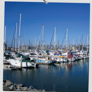
Boats in the Oxnard Marina, California.

While searching for sea glass, I couldn't help but think how people might relate to sea glass. When I found a piece, it was like finding a gem lost in the sand and rocks. It made me think of the parable Jesus spoke concerning the lost sheep in Luke 15. This teaching states that Jesus is willing to leave His ninety-nine sheep in the wilderness to go after one wayward sheep. The glass has been lost in the ocean for possibly decades. If you have been lost and caught in this world's turbulence, you have a choice to come out of the chaos and enter into the peace Jesus has for you (John 14:27).