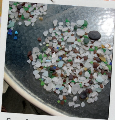
Sea glass that was collected on the California beach.