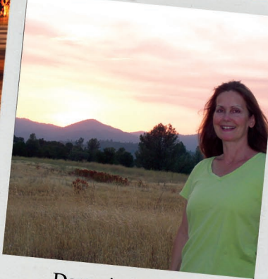
Dawn in Redding.