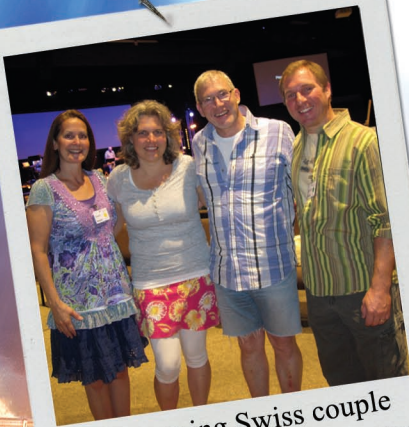
An amazing Swiss couple we met in the Healing Rooms.