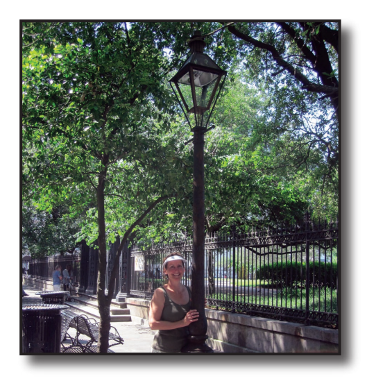
Dawn in Jackson Square, New Orleans.