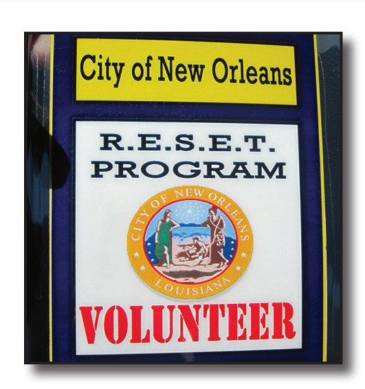
Our R.E.S.E.T. badge from the police department.