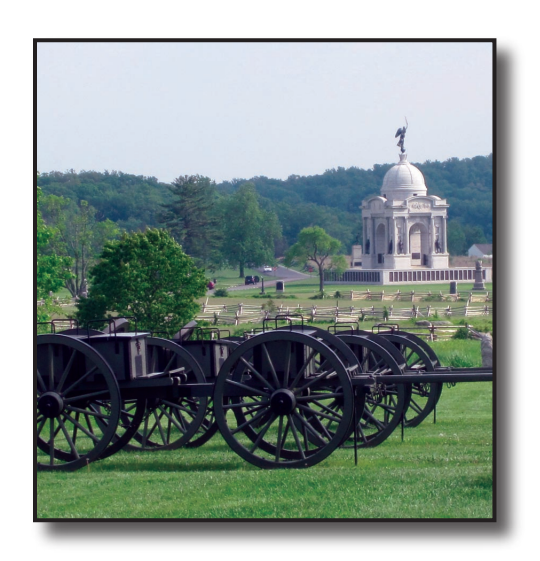
Gettysburg, Pennsylvania battlefield and memorials.