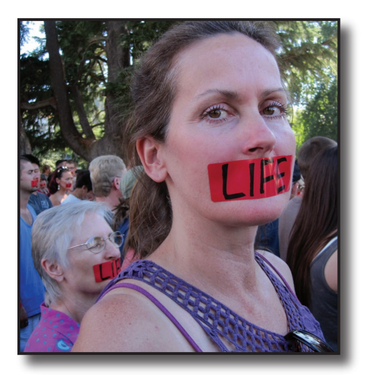
At the Call—Sacramento, we prayed against abortion, and we choose life.