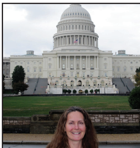
Dawn at the State Capitol Building in Washington DC.