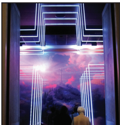
The Billy Graham Library in Charlotte, North Carolina